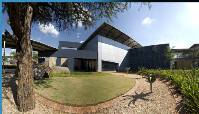
Microworks head office

Contact us on: 086 111 2556 or sales@microworks.co.za